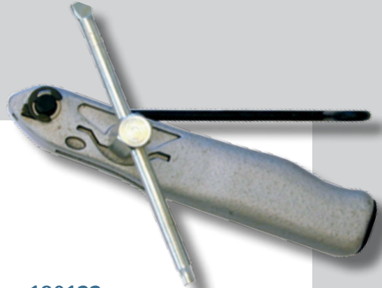
Tool no. 190133

This tool can be used to both tighten and cut cable ties.