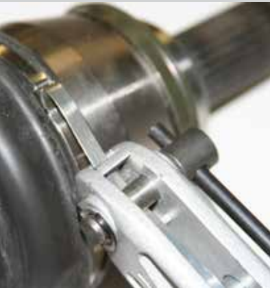
Endless retaining clips part no. 190136 (Content: 25 pieces)

If the defective original boot is made of TPE, then it may only be replaced by an original LÖBRO TPE boot designed for this application. It is capable to fulfill the more complex demands of the respective driveline system reliably.